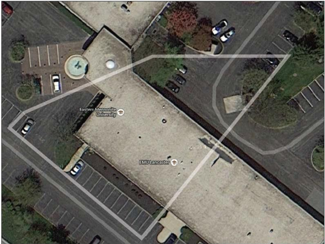
1846 CHARTER LANE, LANCASTER, PA

EMU has a small satellite non-residential campus in Lancaster, PA. It is located in an attractive suburban office park. The address is 1846 Charter Lane, Lancaster, PA. 17605.