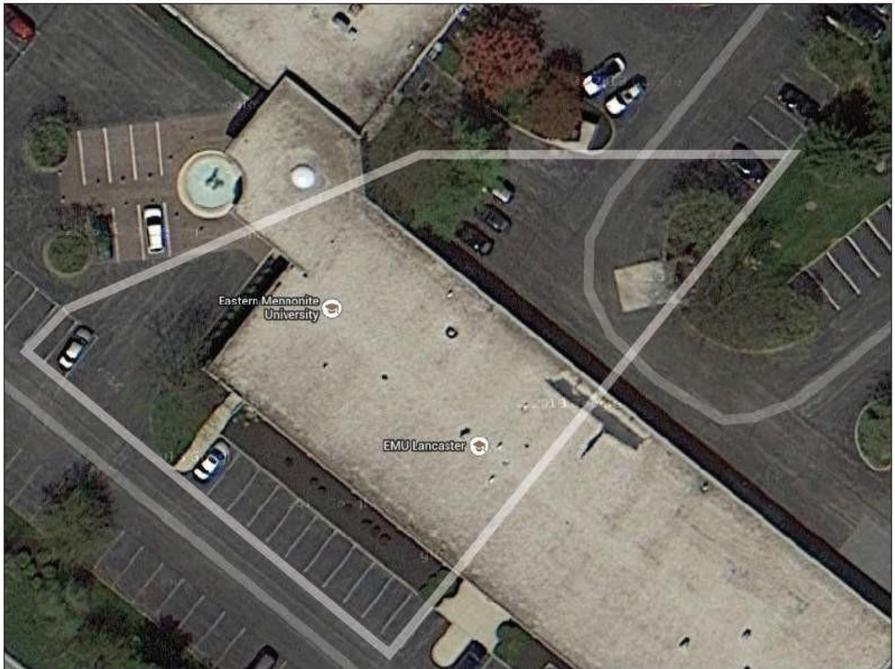
1846 CHARTER LANE, LANCASTER, PA

EMU has a small satellite non-residential campus in Lancaster, PA. It is located in an attractive suburban office park. The address is 1846 Charter Lane, Lancaster, PA. 17605 . This location is not considered by the University as a separately administered location as all administrative, academic, and operations decision-making is centralized in the President's Office Executive Leadership Team.